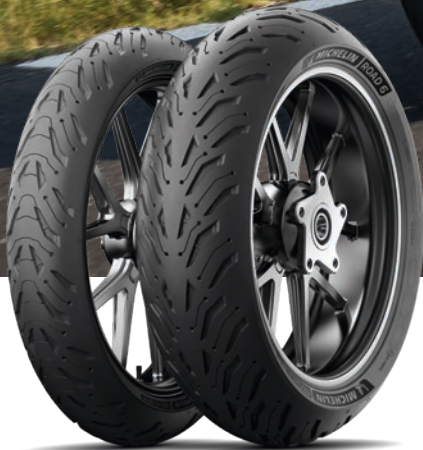
MICHELIN® Road 6 Tires